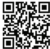
NetBenefits® smartphone and iPad® app